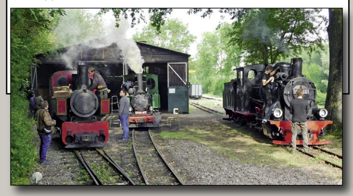
Le P'tit train de la haute Somme is twinned with the Leighton Buzzard Railway, North of London.

The P'tit train is run by a team of volunteers: you can join them! You want to know everything about a tourist steam train? You wish to drive a real locomotive? You just need to improve your French? Painter, mechanic, carpenter, fireman, driver, receptionnist, etc. There is surely one (or several) activity for you! Please ask for information at the reception or have a talk with the volunteers in the Museum, they will be pleased to tell you about their passion! More information, please visit our website: www.appeva.org